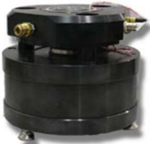
Air Bearing Shaker

The Models K394B30 and K394B31 Calibration Shaker Systems represent a new level of performance in calibration grade shakers. As the centerpiece of these systems, the 396C10 and 396C11 air bearing shakers continue the award winning PCB Group tradition of providing superior performance characteristics and ease of use while offering exceptional value and simplicity. A graphite air bearing combined with an ultra-stiff lightweight armature essentially eliminates transverse motion that plagues traditional flexure based shaker armature suspension systems.